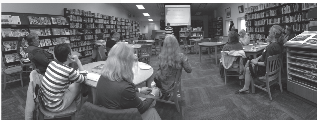
Faculty meet in the newly refurbished Library for a professional development workshop on the MLTI initiative.

In the summer of 2013, our biggest project was to reconfigure the cafeteria courtyard into an attractive and serviceable greenspace. An expanse that before had been used solely to move from one place to another, the courtyard is now enjoyed by students and faculty as they eat lunch, talk, or just relax in an inviting environment. At the same time, we eliminated a dangerous and ugly set of concrete steps, replacing them with an aluminum staircase that more effectively ties the courtyard to the front campus. Our third major project, while not glamorous, was necessary: we updated the Wyandotte Building’s waste disposal system, connecting it directly to the town sewer system. The Library also got a facelift: carpet was replaced, the entire room was painted, and shelves and furniture were rearranged. The exterior walls of the science wing were also painted and the bricks resealed. The skywalk between the science wing and the Library needed new shingles, and while we were there, we saved money by reshingling a portion of the science wing a year sooner than necessary. Finally, we began a four-step process to update the school fire alarm system to tie all buildings into one alarm. Over the 2013 winter break, we renovated the bathrooms in the science wing.