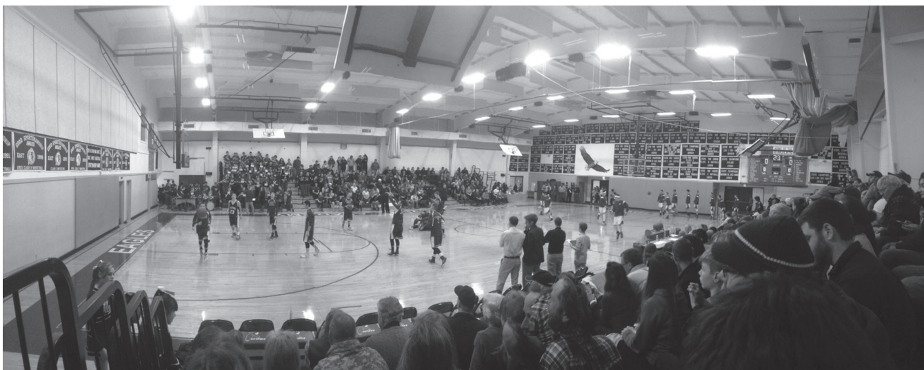
New LED high-efficiency lights illuminate the gymnasium and show off the 2014 Class Gift, "Soaring Eagle," adorning the west wall.